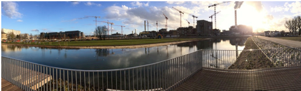
Saint-Ouen (Paris city-region, France), ZAC des Docks (Docklands Urban Development Project)