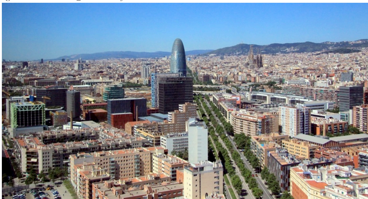
Figure 1 – Barcelona 22@ District as of 2012