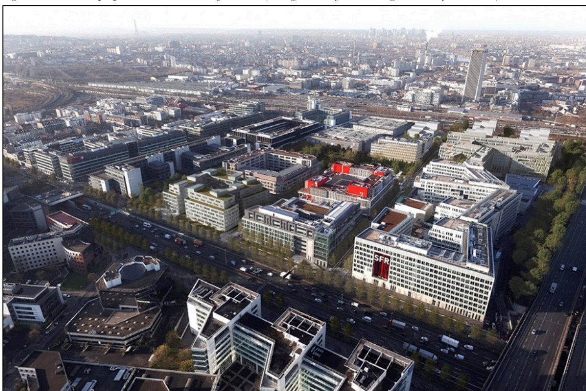
Figure 4 – Business properties in ZAC Landy-France (background: left, Paris; right, La Défense CBD)