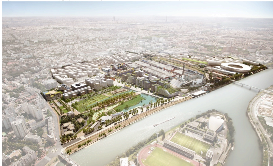
Figure 5 – Aerial view of projected buildings in Docks de Saint-Ouen (background: Paris).