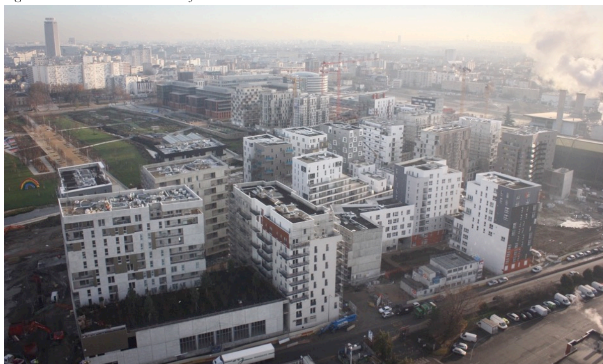
Figure 6 – Docks de Saint-Ouen as of December 2014