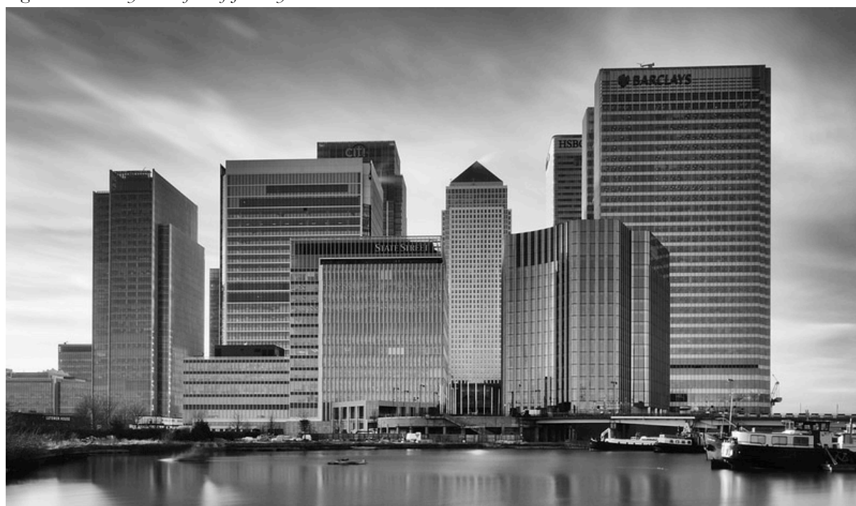
Figure 3 – Canary Wharf as of January 2014